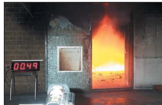
Figure 2 – Room corner test before Flashover – photo courtesy of Factory Mutual