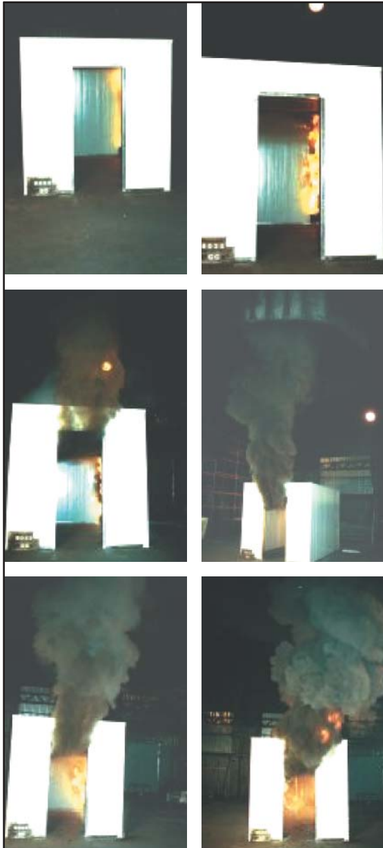
Figures 4, 5, 6, 7, 8 & 9 - Typical progressive fire development under ISO13784 Part 1 testing showing contribution of insulated (sandwich) panels to fire – photos are at 1,3,5, 7, 9 & 11 minutes respectively