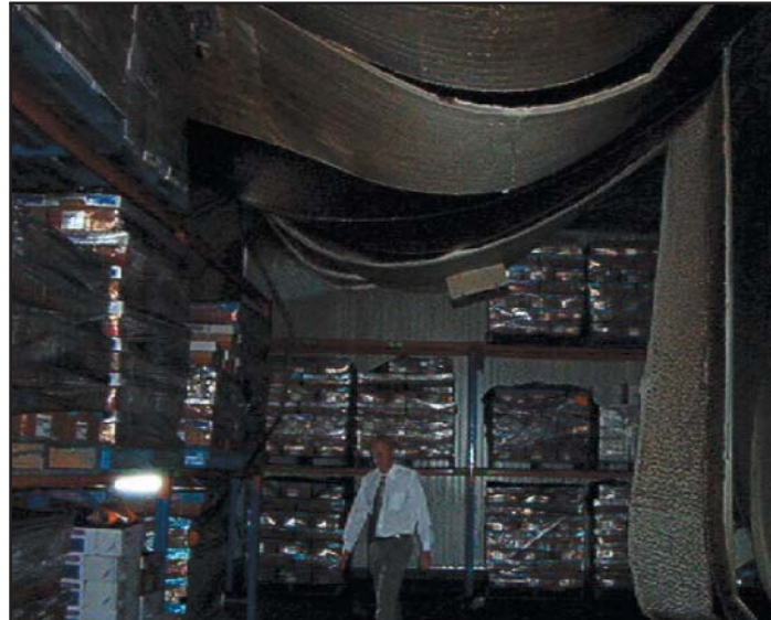
Picture showing structural damage to EPS type sandwich panels due to a fire, which spread, within the combustible cavity of the panels themselves

The fire properties of core materials can