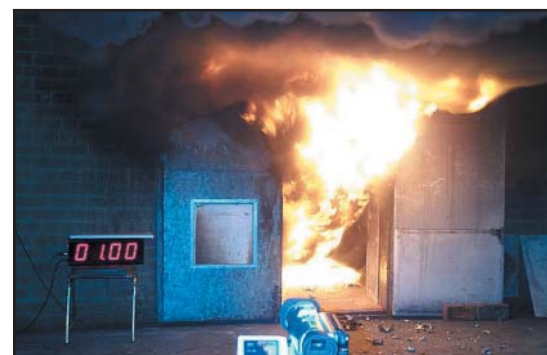
Figure 3 - Room corner test conducted after Flashover – photo courtesy of Factory Mutual