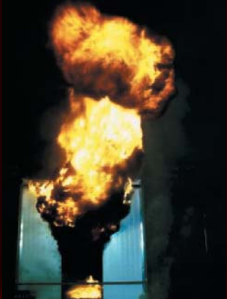
Picture showing the Flashover during a room corner test on an EPS sandwich panel construction

By far one of the most topical issues at present relating to the field of Passive Fire & Smoke Containment is that of the fire resistance properties and/or the reaction to fire properties of insulated (sandwich) panels. Insurance companies world wide have in recent times taken a very strong stance following on from the number and severity of fires involving insulated (sandwich) panels used as wall and/or roof lining materials; in particular those manufactured from steel clad Expanded Polystyrene, (EPS) core materials. Facilities that incorporate EPS based insulated (sandwich) panels here locally in Australia are finding it very difficult and/or very expensive to get property protection and/or business interruption insurance. This fact is a surprise to many Australian based building owners or facility operators who are looking to get first time insurance or renew an existing insurance policy for their facility, especially as their facility was designed, built and complies with the Building Code of Australia [1], (BCA). It is questionable whether the average building owner is aware that the BCA requirements are the minimum requirements only, and that they deal predominately with life safety only, not with the protection of property and/or protection against business interruption. They are certainly finding this out the hard way when they are dealing with their insurance broker.