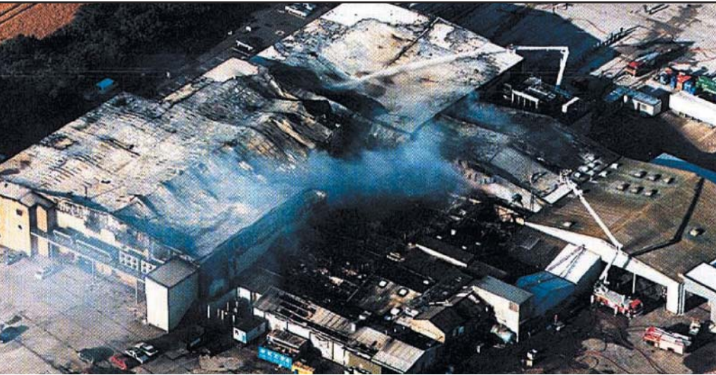
Fires in building made from insulated (sandwich) panels have caused huge losses which have been born by the insurance industry and have resulted in additional protection requirements imposed by insurance on building owners, above and beyond the Building Code of Australia

there is no hidden flame spread within the panel cores with external panel systems. Decomposition under these conditions is significantly different from testing the product in isolation.