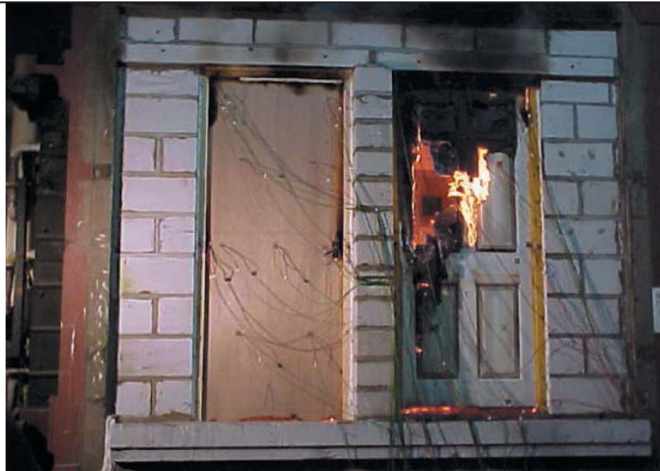
Figure 10 – AS 1530 Part 4 fire resistance test on two single leaf prototype door constructions